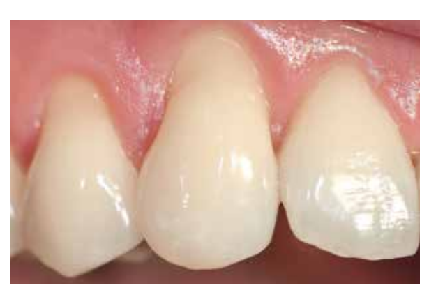
Initial situation on teeth 13 and 14